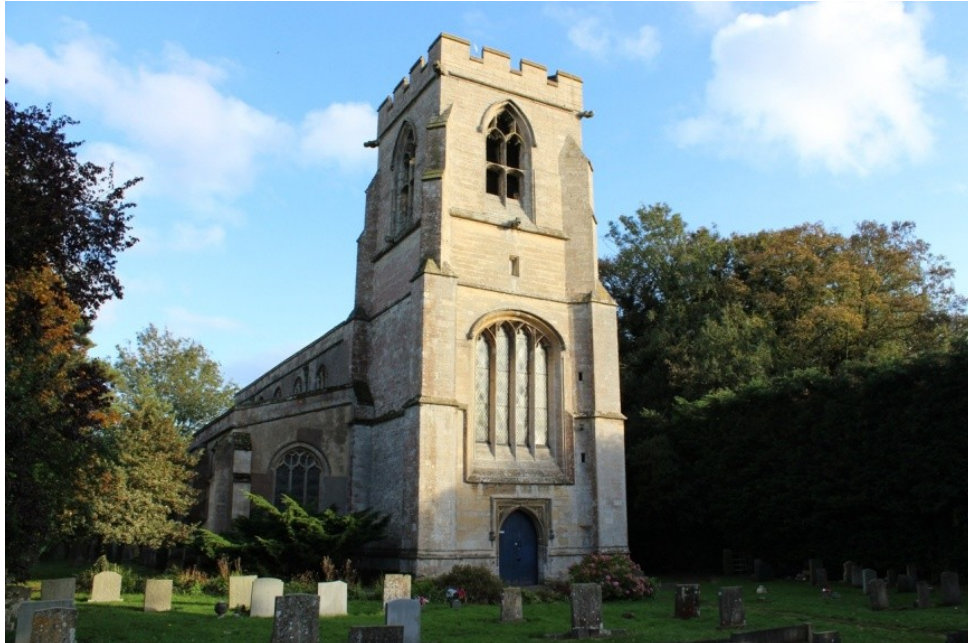
The Parish Church of St Leodegar Wyberton